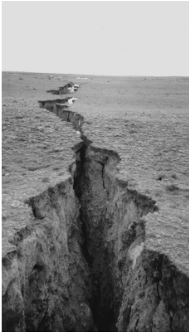
Fig. 1. Seismic rupture during the Altai earthquake more than 6 km long and up to 10 m wide.

had a living eyewitness. A Turkish fisherman who sat in a boat in a narrow and shallow strait near Cape Goelchuk (the Gulf of Izmit of the Sea of Marmara) felt an intense vibration (earthquake). Almost immediately, water started to go downward and his boat appeared to stand on the sea bottom. Vertical water walls about 15 m high stood at some distance on both sides of the bottom. Then, the water walls started to approach each other, large waves were formed, and the boat was carried out to the shore by a strong flow.